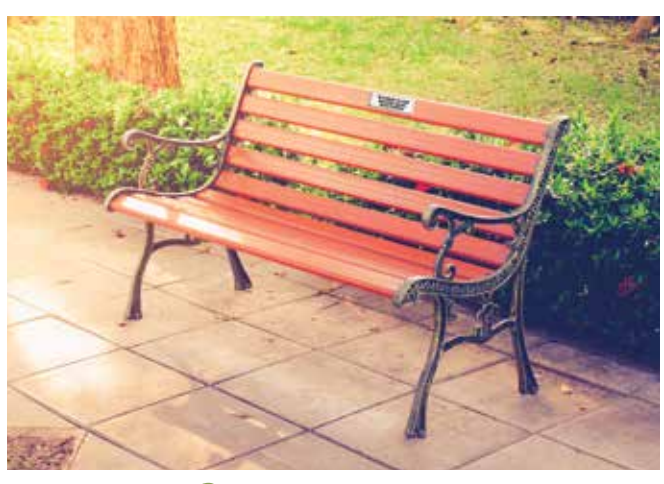
Paving the Way to Recovery - Together!

$1,000 — 4" x 8" paver with up to 3 lines $5,000 — 12" x 12" paver with up to 4 lines $10,000 — 48" x 23" x 35.5" bench (up to 4 lines)