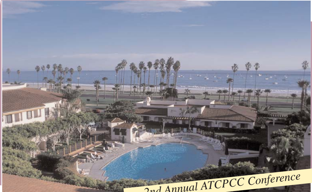
2nd Annual ATCPCC Conference

The ATCPCC conference is an extraordinary opportunity for professionals to exchange information in an effort to create a seamless continuum of care to meet the needs of all patients.