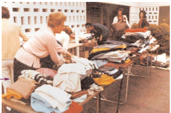
Repeat Boutique Opening Day

Thrift Shop (later renamed Repeat Boutique) opens with sales benefiting New Directions for Women.