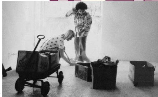
Moving into the New Directions buildings, 1977

New Directions for Women is given the option to lease three homes at 2600, 2601 and 2603 Willo Lane, Costa Mesa from the Orange County Board of Supervisors, giving NDFW its home site.