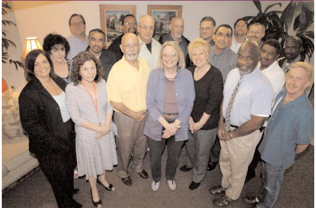
The staff of Michael's House in Palm Springs continues the tradition of providing recovery treatment and services for men.